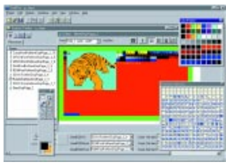
TEDIPRO for Fast & Easy OSD-Development

The SDA 555x is available in samples now and will be ready for mass production from beginning of year 2000 onwards. Please contact your local Infineon Office for further details.